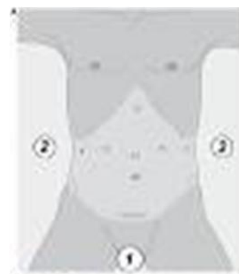
Figure 1: The mesh is placed on the hernia defect with or without tacks. Reducing CO 2 to zero mmHg leaving the posterior fascia and peritoneum to compress the mesh under the rectus muscles.

with the monopolar or bipolar device. Continuing first laterally to the right and left of the umbilicus under the rectus muscles just to the ribs unlike TEP: Reverse TEP. The hernia is left to the last dissection. After having formed the pre-peritoneal space by equalizing the epigastric vessels and the rectus muscles, applying blunt dissection to the ventral or incisional hernia without opening the peritoneum. Accurate revision of haemostasis. Reducing CO 2 to 8 mmHg. The mesh is placed on the hernia defect with or without tacks. Reducing CO 2 to zero mmHg leaving the posterior fascia and peritoneum to compress the mesh under the rectus muscles. [Figure 1 - 3]