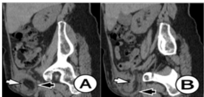
Figure 2: A 69-year-old female with right-sided Amyand's hernia. Sagittal reformatted CT image of the abdomen: Sagittal reformatted CT image shows an inflamed appendix (white arrow) extends into the small right inguinal hernia (black arrow). There were no signs of obstruction or strangulation.