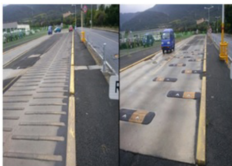
Figure 2: Measurement Course