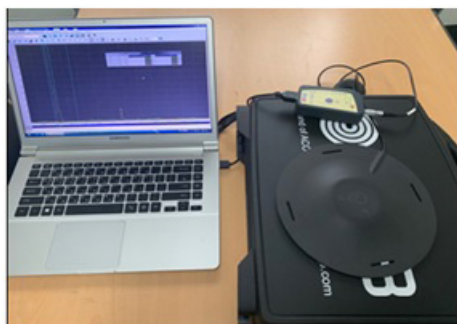
Figure 3: Measurement Device