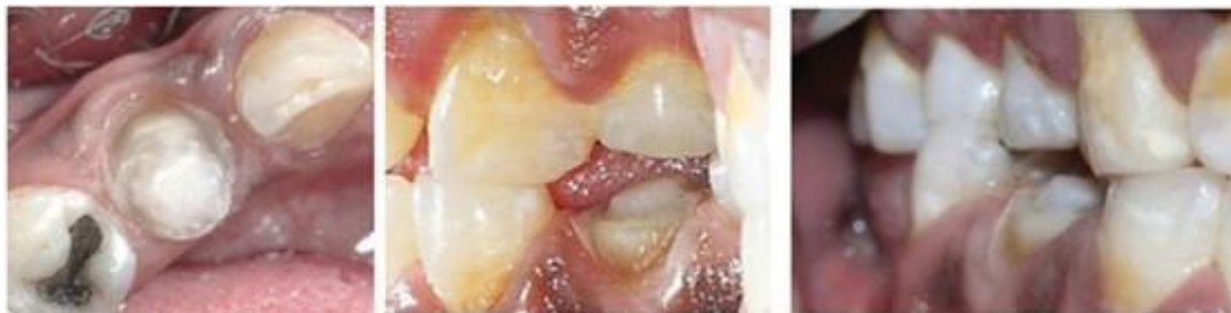
Figure 3, 4 and 5: Final tooth preparation