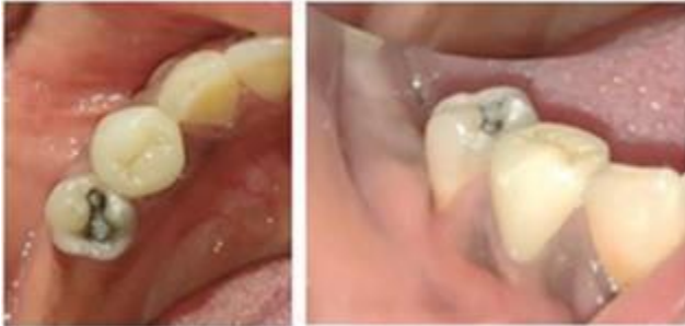
Figure 7 and 8: Postcementation