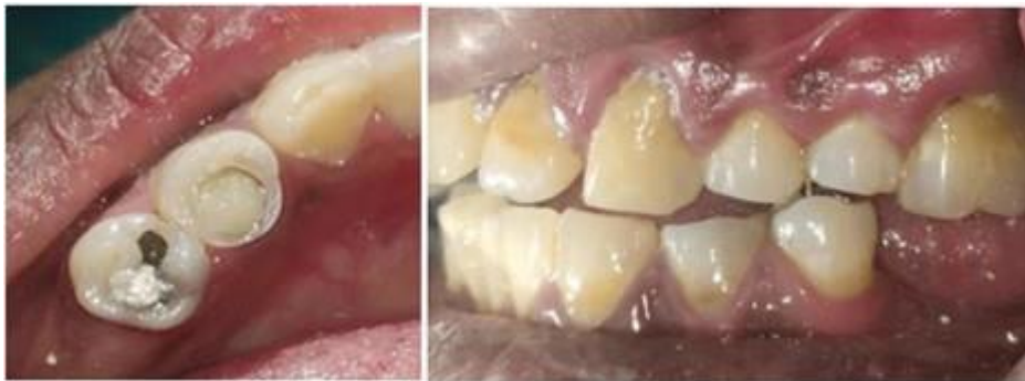
Figure 1 and 2: Pre-operative

Silane coupling agent was applied for 1 min and dried. The tooth was etched for 10 seconds and washed and dried using botting paper. Adhesive was applied and cured for 20 secs. Resin cement was applied on the inner surface and vonlay was cemented using light cure. The gross occlusal discrepancies were marked with articulating paper strips and later removed before cementation (Figure 7 and 8).